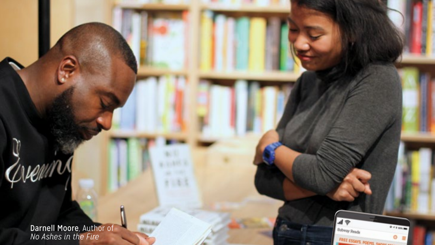
Darnell Moore, Author of No Ashes in the Fire